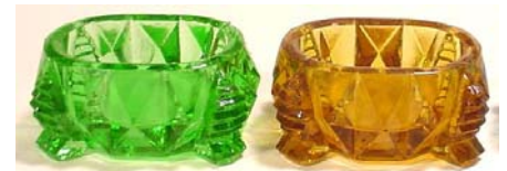
H&J 367 – Footed Salt Dark Blue – Med Blue - Pale Aqua Blue – Amber – Clear – Avocado Green – Med Green – Vaseline Green – Milky Blue – Milky Blue Decorated