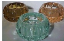
Paden City Nr 10 Individual Salt Amber – Pink – Pale Green – Lt Blue

Pink Flared top, marked & band around bowl has buttons. Blue Green – Clear – Marigold – Pale Yellow – Pink w/Gold Trim Straight top, marked & band around bowl has button.. Clear