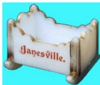
H&J 855 – Cradel Salt Clear – Amber – Blue – Milk – Milk Decorated