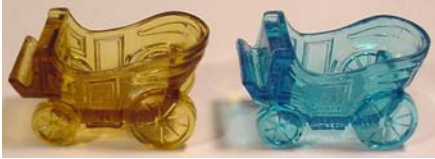
H&J 417 – Coach Salt Blue – Clear – Amber