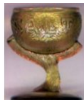
H&J 3581 – Tree of Life Salt Clear – Amber Some conversations on the Amber as some think that it may have been irradiated to change color.