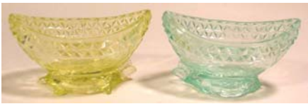
H&J 506 – Wildflower Pattern on back of Turtle Salt Amber – Lt Blue - Lt Green – Canary – Clear