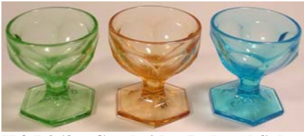
H&J 368 – Cambridge Pedestal Salt Green – Blue – Pink – Clear – Lt Amber