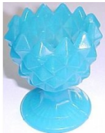
H&J 3526 – Sawtooth Salt With Cover, Clear – Milk W/O Cover, Clear – Milk – Blue Milk