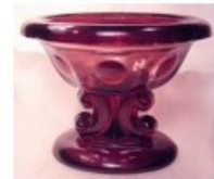
Coddington 31-3-1 Clear – Amethyst – Cobalt