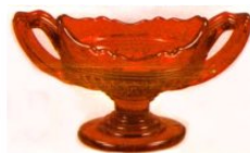
H&J 821 – Cambridge MtVernon Salt Marked with C in Triangle only. Has been reproduced in many colors unmarked Clear – Milk – Crown Tuscan – Red – Dark Green – Cobalt –Milk w/Gold Trim