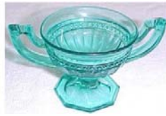
H&J 2093 – Fancy Colonial Salt As Pictured in H&J. Flared top, unmarked & plain band on bowl.

Pink Flared top, marked & band around bowl has buttons. Blue Green – Clear – Marigold – Pale Yellow – Pink w/Gold Trim Straight top, marked & band around bowl has button.. Clear